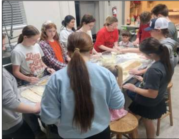
King Cakes 2025

Thank You to all who participated in the fun!